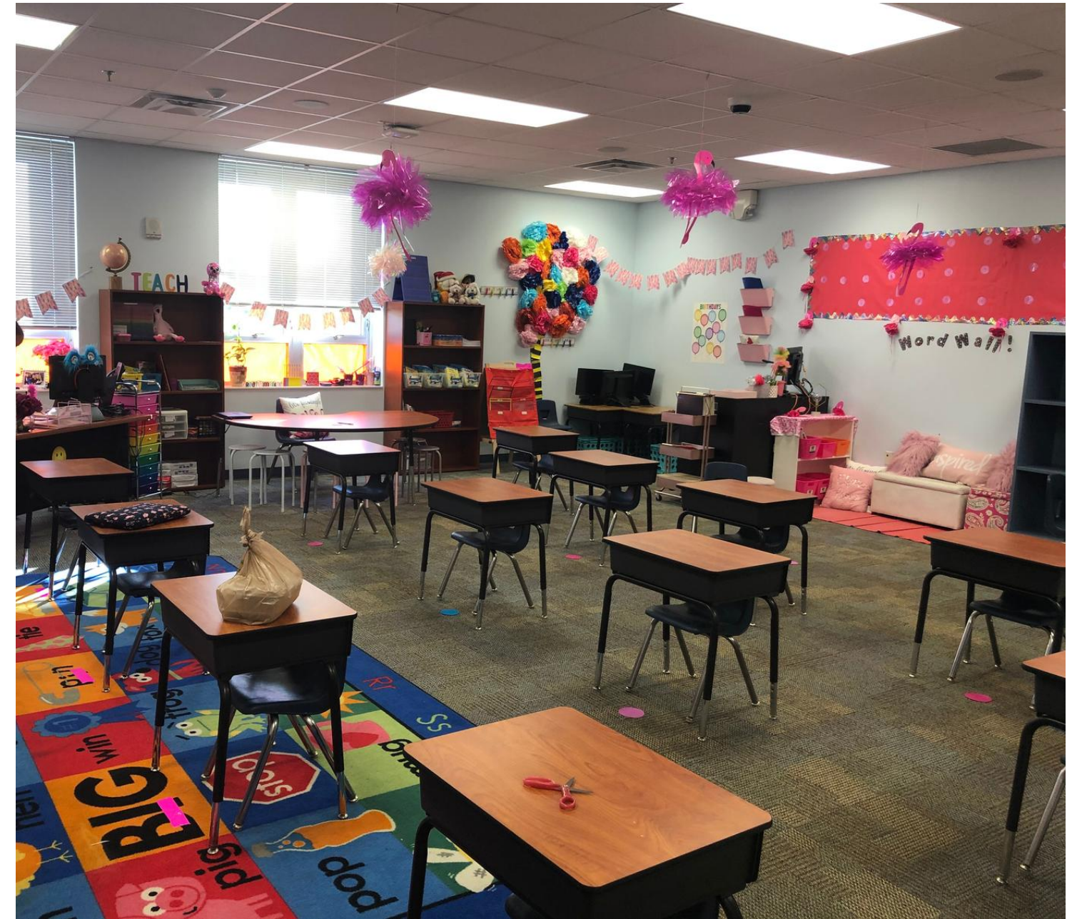
— Here are some samples of our classrooms.